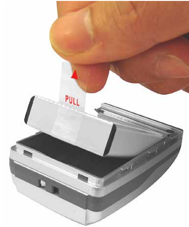
Figure 2 Take out the battery with pull tag